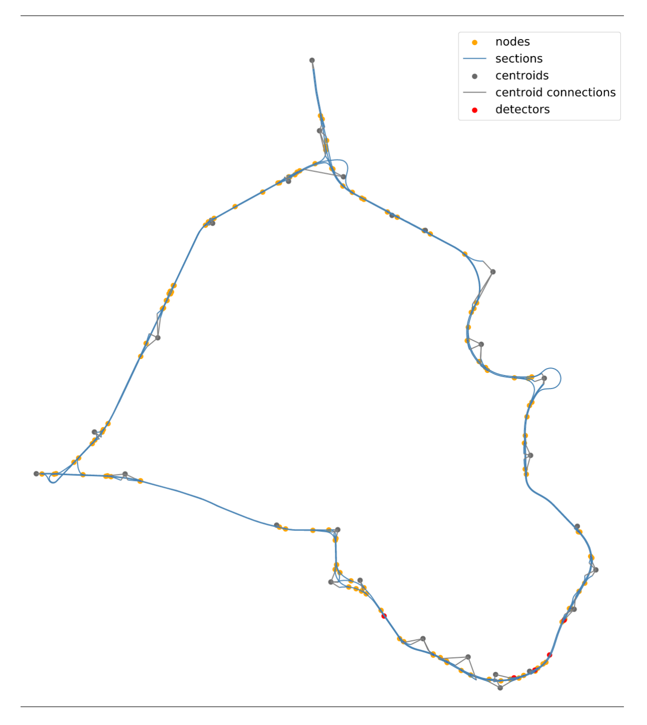
Figure 3: The Antwerp ring road.

loaded and calibrated in Aimsun microsimulation software. The base scenario demand utilizes traffic counts from morning peak hours. The Origin-Destination (OD) matrix has been derived within Aimsun software from static OD adjustment by using Frank and Wolfe algorithm.